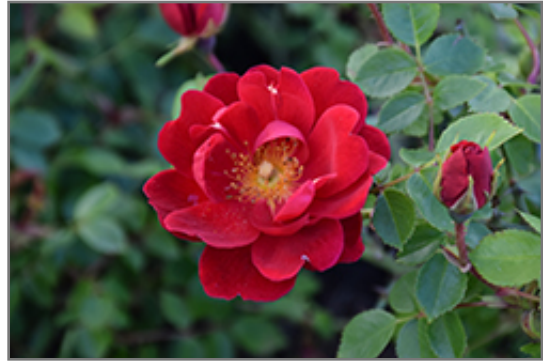
Oso Easy Urban Legend Rose flowers

This shrub should only be grown in full sunlight. It does best in average to evenly moist conditions, but will not tolerate standing water. It is not particular as to soil type or pH. It is somewhat tolerant of urban pollution. This particular variety is an interspecific hybrid.