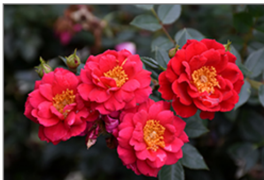
Oso Easy Urban Legend Rose flowers

Oso Easy Urban Legend Rose is recommended for the following landscape applications;