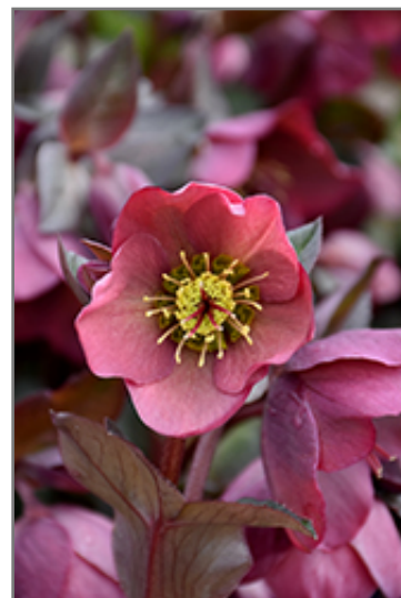
Penny's Pink Hellebore flowers

This is a relatively low maintenance plant, and should be cut back in late fall in preparation for winter. Deer don't particularly care for this plant and will usually leave it alone in favor of tastier treats. It has no significant negative characteristics.