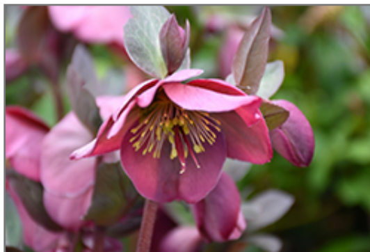
Penny's Pink Hellebore flowers