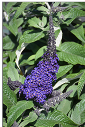
Pugster Blue Butterfly Bush flowers

Pugster Blue Butterfly Bush is recommended for the following landscape applications;