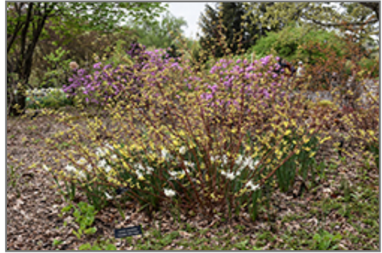
Neon Burst Dogwood in spring

Neon Burst Dogwood will grow to be about 5 feet tall at maturity, with a spread of 5 feet. It tends to fill out right to the ground and therefore doesn't necessarily require facer plants in front, and is suitable for planting under power lines. It grows at a fast rate, and under ideal conditions can be expected to live for approximately 20 years.