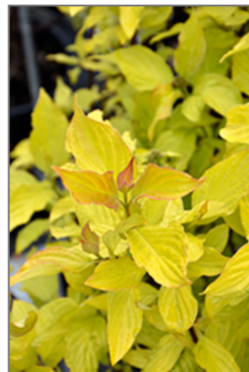
Neon Burst Dogwood foliage