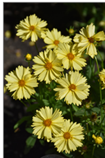
Leading Lady Lauren Tickseed flowers