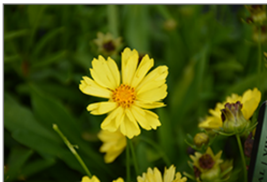
Leading Lady Sophia Tickseed flowers

Leading Lady Sophia Tickseed is recommended for the following landscape applications;