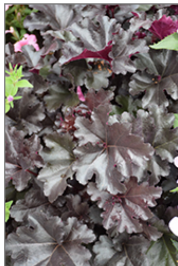
Black Pearl Coral Bells foliage

Black Pearl Coral Bells is recommended for the following landscape applications;