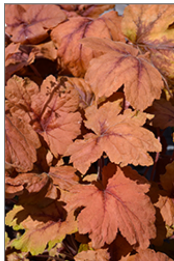
Pumpkin Spice Foamy Bells foliage

Pumpkin Spice Foamy Bells is recommended for the following landscape applications;