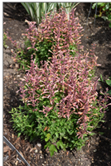
Mango Tango Hyssop in bloom