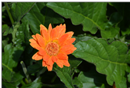
Electric Orange Drakensberg Daisy Hardy Garden Gerbera flowers

When grown indoors, Electric Orange Drakensberg Daisy Hardy Garden Gerbera can be expected to grow to be about 15 inches tall at maturity, with a spread of 18 inches. It grows at a fast rate, and under ideal conditions can be expected to live for approximately 3 years. This houseplant will do well in a location that gets either direct or indirect sunlight, although it will usually require a more brightly-lit environment than what artificial indoor lighting alone can provide. It does best in average to evenly moist soil, but will not tolerate standing water. The surface of the soil shouldn't be allowed to dry out completely, and so you should expect to water this plant once and possibly even twice each week. Be aware that your particular watering schedule may vary depending on its location in the room, the pot size, plant size and other conditions; if in doubt, ask one of our experts in the store for advice. It is not particular as to soil type or pH; an average potting soil should work just fine.