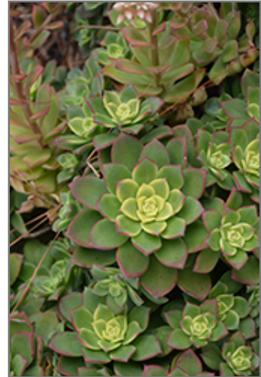
Kiwi Aeonium foliage

Kiwi Aeonium is a fine choice for the garden, but it is also a good selection for planting in outdoor pots and containers. Because of its spreading habit of growth, it is ideally suited for use as a 'spiller' in the 'spiller-thriller-filler' container combination; plant it near the edges where it can spill gracefully over the pot. Note that when growing plants in outdoor containers and baskets, they may require more frequent waterings than they would in the yard or garden.