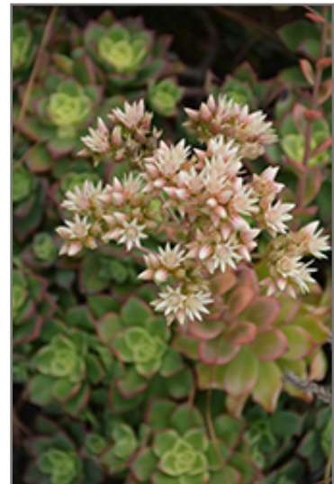
Kiwi Aeonium flowers