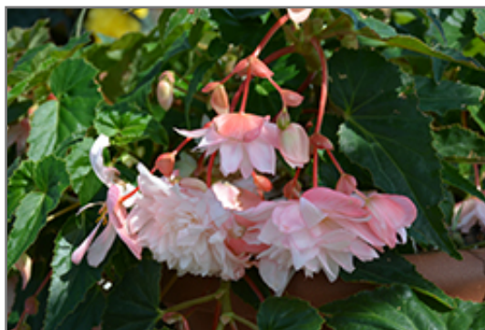
Belleconia Apricot Blush Begonia flowers

Belleconia Apricot Blush Begonia is recommended for the following landscape applications;