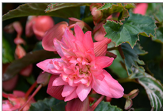
Funky Pink Begonia flowers