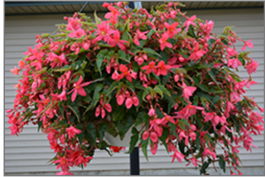
Funky Pink Begonia in bloom

Funky Pink Begonia is a fine choice for the garden, but it is also a good selection for planting in outdoor containers and hanging baskets. It is often used as a 'filler' in the 'spiller-thriller-filler' container combination, providing a mass of flowers and foliage against which the thriller plants stand out. Note that when growing plants in outdoor containers and baskets, they may require more frequent waterings than they would in the yard or garden.