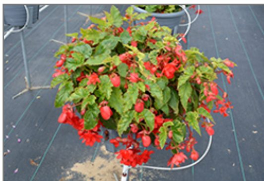
Illumination Rose Begonia in bloom