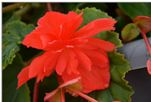
Illumination Rose Begonia flowers