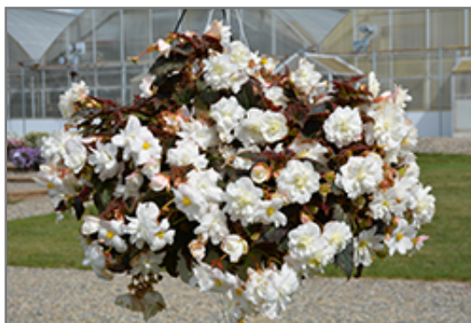
Nonstop Joy Mocca White Begonia in bloom