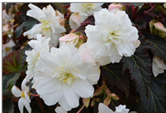
Nonstop Joy Mocca White Begonia flowers

Nonstop Joy Mocca White Begonia is recommended for the following landscape applications;