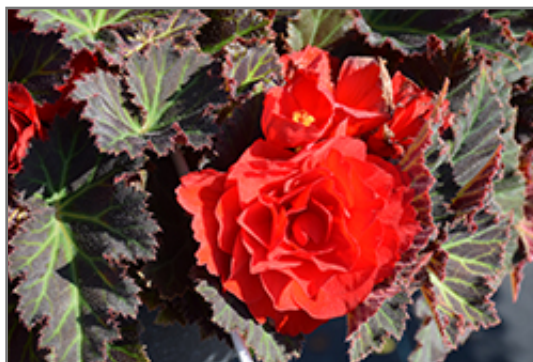
Nonstop Mocca Red Begonia flowers

Nonstop Mocca Red Begonia is recommended for the following landscape applications;