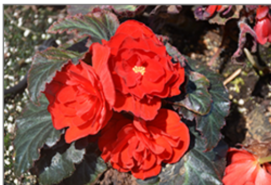
Nonstop Mocca Red Begonia flowers