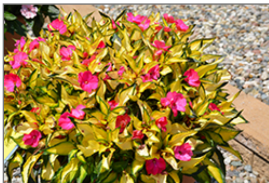
SunPatiens Compact Tropical Rose New Guinea Impatiens in bloom