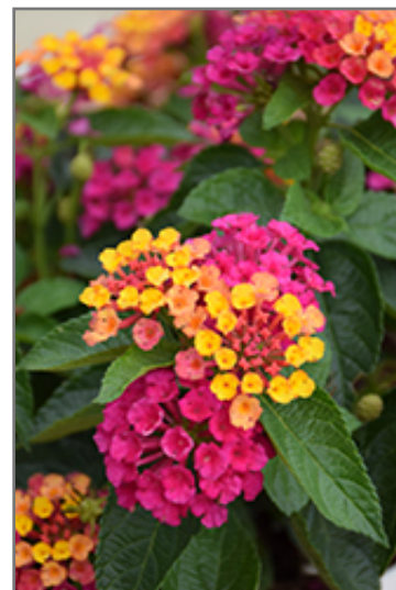
Luscious Royale Cosmo Lantana flowers

Luscious Royale Cosmo Lantana is recommended for the following landscape applications;