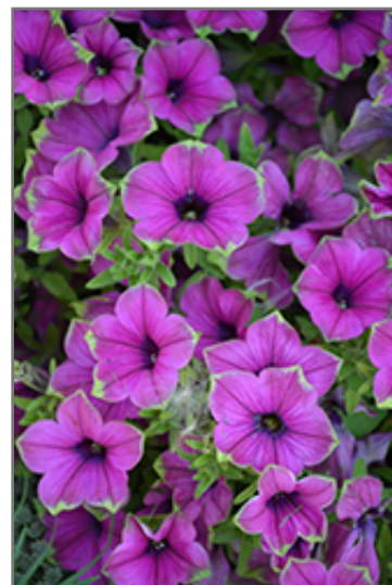
Supertunia Picasso In Purple Petunia flowers

Supertunia Picasso In Purple Petunia is a dense herbaceous annual with a trailing habit of growth, eventually spilling over the edges of hanging baskets and containers. Its medium texture blends into the garden, but can always be balanced by a couple of finer or coarser plants for an effective composition.