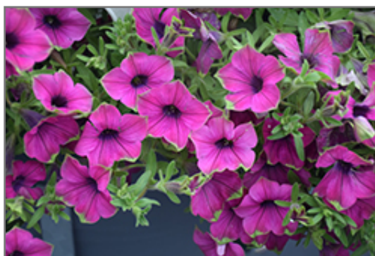
Supertunia Picasso In Purple Petunia flowers