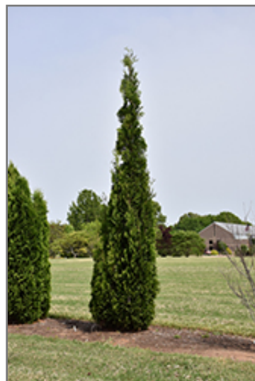
Thin Man Arborvitae