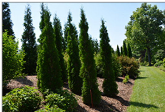
Thin Man Arborvitae