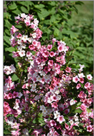
Czechmark Trilogy Weigela flowers

This shrub should only be grown in full sunlight. It prefers to grow in average to moist conditions, and shouldn't be allowed to dry out. It is not particular as to soil type or pH. It is highly tolerant of urban pollution and will even thrive in inner city environments. This is a selected variety of a species not originally from North America.