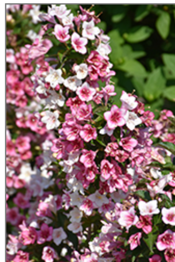
Czechmark Trilogy Weigela flowers