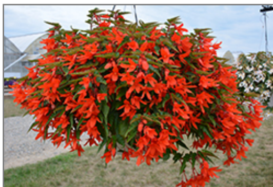
Waterfall Encanto Orange Begonia in bloom