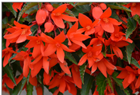
Waterfall Encanto Orange Begonia flowers

Waterfall Encanto Orange Begonia is an herbaceous evergreen perennial with a trailing habit of growth, eventually spilling over the edges of hanging baskets and containers. Its medium texture blends into the garden, but can always be balanced by a couple of finer or coarser plants for an effective composition.