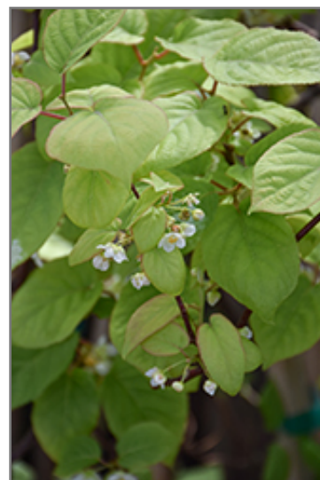
Variegated Hardy Kiwi Vine flowers