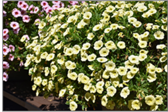
Cabaret Lemon Yellow Calibrachoa flowers

Cabaret Lemon Yellow Calibrachoa will grow to be about 10 inches tall at maturity, with a spread of 18 inches. When grown in masses or used as a bedding plant, individual plants should be spaced approximately 12 inches apart. Its foliage tends to remain low and dense right to the ground. This fast-growing annual will normally live for one full growing season, needing replacement the following year.