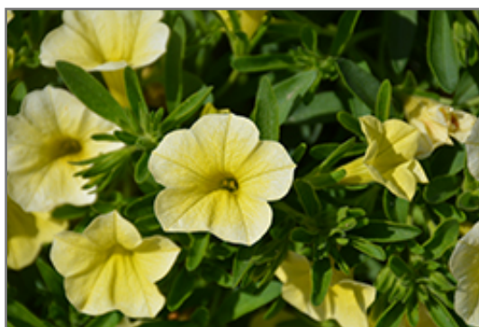
Cabaret Lemon Yellow Calibrachoa flowers