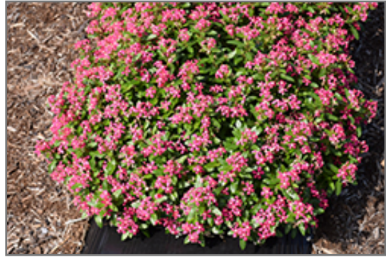
Soiree Kawaii Coral Vinca in bloom

Soiree Kawaii Coral Vinca is a fine choice for the garden, but it is also a good selection for planting in outdoor containers and hanging baskets. Because of its trailing habit of growth, it is ideally suited for use as a 'spiller' in the 'spiller-thriller-filler' container combination; plant it near the edges where it can spill gracefully over the pot. Note that when growing plants in outdoor containers and baskets, they may require more frequent waterings than they would in the yard or garden.