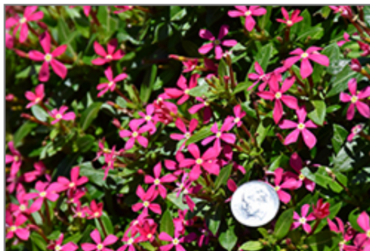
Soiree Kawaii Coral Vinca flowers