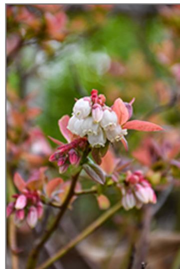
Blueberry Glaze Blueberry flowers

Blueberry Glaze Blueberry is a good choice for the edible garden, but it is also well-suited for use in outdoor pots and containers. It can be used either as 'filler' or as a 'thriller' in the 'spiller-thriller-filler' container combination, depending on the height and form of the other plants used in the container planting. It is even sizeable enough that it can be grown alone in a suitable container. Note that when grown in a container, it may not perform exactly as indicated on the tag - this is to be expected. Also note that when growing plants in outdoor containers and baskets, they may require more frequent waterings than they would in the yard or garden.