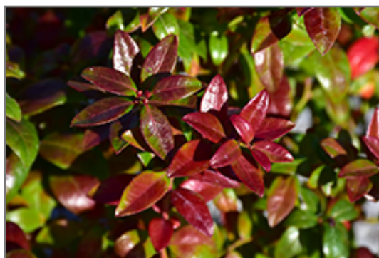
Blueberry Glaze Blueberry in fall