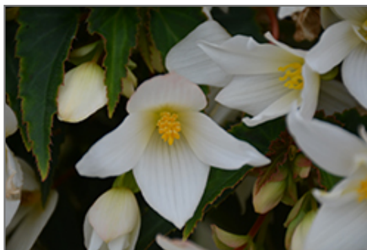
Beauvilia White Begonia flowers