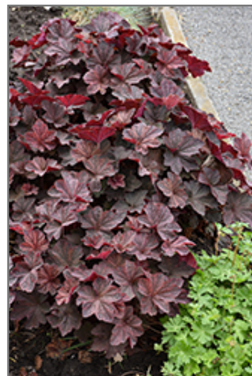
Palace Purple Coral Bells

This is a relatively low maintenance plant, and should be cut back in late fall in preparation for winter. It is a good choice for attracting hummingbirds to your yard. It has no significant negative characteristics.