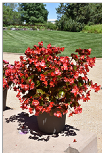
Megawatt Red Bronze Leaf Begonia flowers