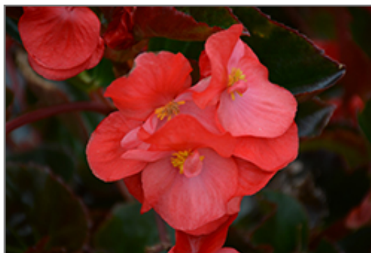
Megawatt Red Bronze Leaf Begonia flowers

Megawatt Red Bronze Leaf Begonia is a fine choice for the garden, but it is also a good selection for planting in outdoor containers and hanging baskets. With its upright habit of growth, it is best suited for use as a 'thriller' in the 'spiller-thriller-filler' container combination; plant it near the center of the pot, surrounded by smaller plants and those that spill over the edges. It is even sizeable enough that it can be grown alone in a suitable container. Note that when growing plants in outdoor containers and baskets, they may require more frequent waterings than they would in the yard or garden.