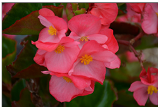
Megawatt Rose Green Leaf Begonia flowers