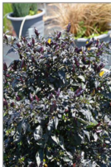
Midnight Fire Ornamental Pepper fruit