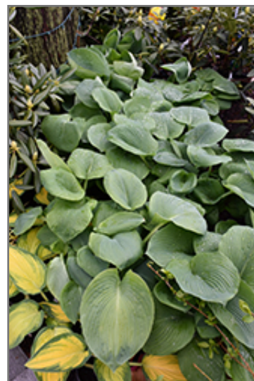
Elegans Hosta