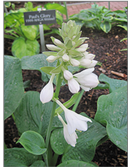
Elegans Hosta flowers

Elegans Hosta will grow to be about 28 inches tall at maturity, with a spread of 4 feet. When grown in masses or used as a bedding plant, individual plants should be spaced approximately 4 feet apart. Its foliage tends to remain dense right to the ground, not requiring facer plants in front. It grows at a slow rate, and under ideal conditions can be expected to live for approximately 10 years. As an herbaceous perennial, this plant will usually die back to the crown each winter, and will regrow from the base each spring. Be careful not to disturb the crown in late winter when it may not be readily seen!