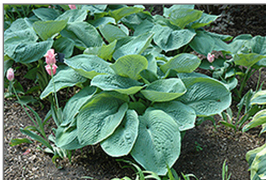
Elegans Hosta