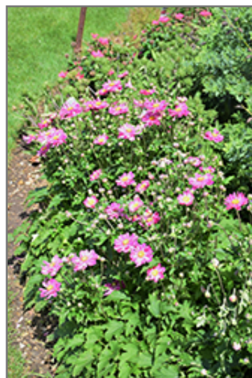
Curtain Call Pink Anemone in bloom