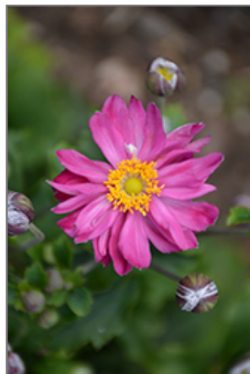
Curtain Call Pink Anemone flowers