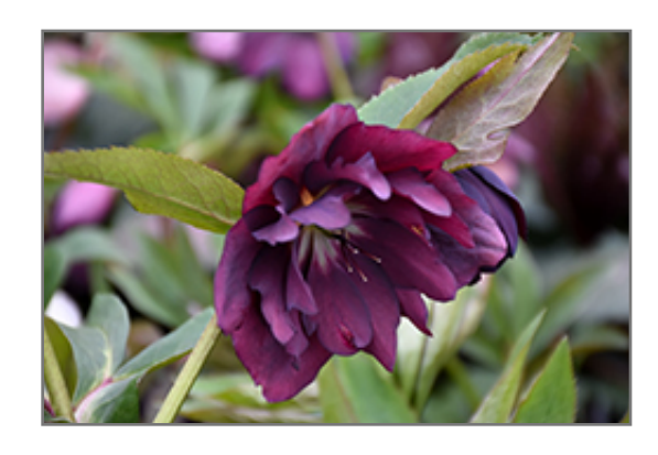
Wedding Party Dashing Groomsmen Hellebore flowers