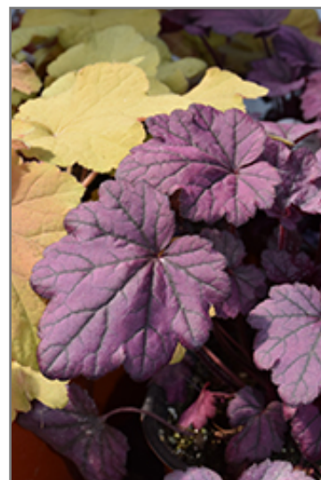
Electric Plum Coral Bells foliage