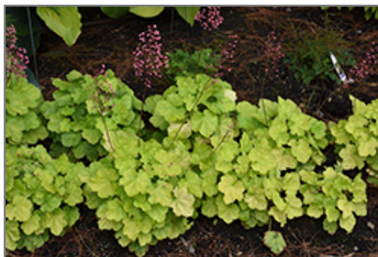
Primo Pretty Pistachio Coral Bells

Primo Pretty Pistachio Coral Bells is a fine choice for the garden, but it is also a good selection for planting in outdoor pots and containers. With its upright habit of growth, it is best suited for use as a 'thriller' in the 'spiller-thriller-filler' container combination; plant it near the center of the pot, surrounded by smaller plants and those that spill over the edges. Note that when growing plants in outdoor containers and baskets, they may require more frequent waterings than they would in the yard or garden.