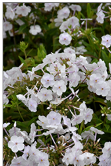
Fashionably Early Crystal Garden Phlox flowers