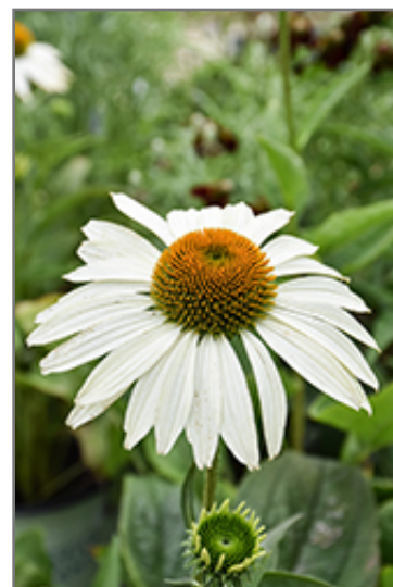
Happy Star Coneflower flowers