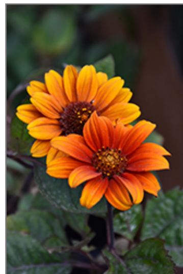
Bleeding Hearts False Sunflower flowers

This is a relatively low maintenance plant, and is best cleaned up in early spring before it resumes active growth for the season. It is a good choice for attracting butterflies to your yard, but is not particularly attractive to deer who tend to leave it alone in favor of tastier treats. It has no significant negative characteristics.