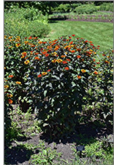
Bleeding Hearts False Sunflower in bloom

This plant does best in full sun to partial shade. It is very adaptable to both dry and moist locations, and should do just fine under typical garden conditions. It is not particular as to soil type or pH, and is able to handle environmental salt. It is highly tolerant of urban pollution and will even thrive in inner city environments. This is a selection of a native North American species. It can be propagated by division; however, as a cultivated variety, be aware that it may be subject to certain restrictions or prohibitions on propagation.