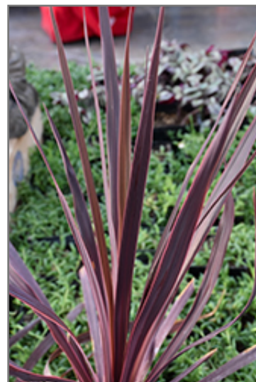
Black Knight Grass Palm foliage