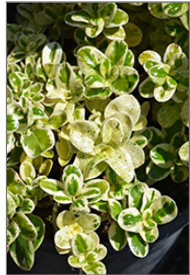
Marble Queen Mirror Bush foliage