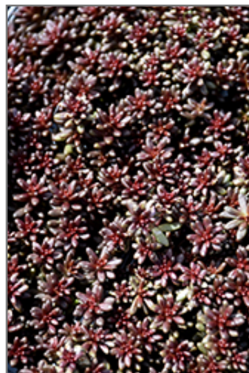
Coral Carpet Stonecrop

Coral Carpet Stonecrop is a fine choice for the garden, but it is also a good selection for planting in outdoor pots and containers. Because of its spreading habit of growth, it is ideally suited for use as a 'spiller' in the 'spiller-thriller-filler' container combination; plant it near the edges where it can spill gracefully over the pot. Note that when growing plants in outdoor containers and baskets, they may require more frequent waterings than they would in the yard or garden.