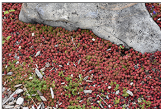
Coral Carpet Stonecrop

Coral Carpet Stonecrop is a dense herbaceous evergreen perennial with a ground-hugging habit of growth. Its medium texture blends into the garden, but can always be balanced by a couple of finer or coarser plants for an effective composition.