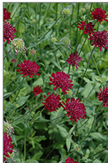
Crimson Scabious flowers

Crimson Scabious will grow to be about 24 inches tall at maturity extending to 3 feet tall with the flowers, with a spread of 24 inches. It tends to be leggy, with a typical clearance of 1 foot from the ground, and should be underplanted with lower-growing perennials. It grows at a fast rate, and under ideal conditions can be expected to live for approximately 3 years. As an herbaceous perennial, this plant will usually die back to the crown each winter, and will regrow from the base each spring. Be careful not to disturb the crown in late winter when it may not be readily seen!