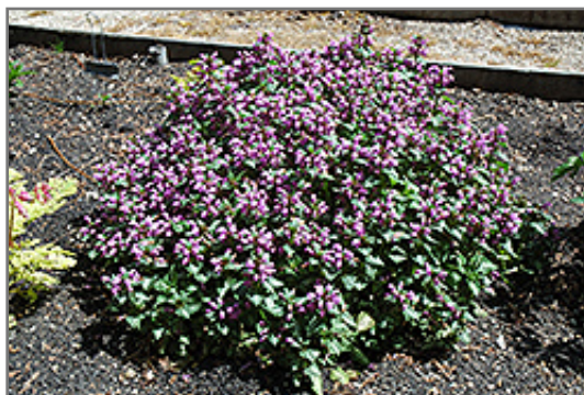
Beacon Silver Spotted Dead Nettle in bloom