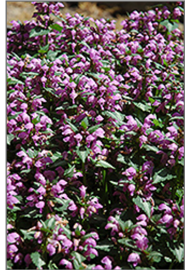
Beacon Silver Spotted Dead Nettle flowers

Beacon Silver Spotted Dead Nettle is a fine choice for the garden, but it is also a good selection for planting in outdoor pots and containers. Because of its spreading habit of growth, it is ideally suited for use as a 'spiller' in the 'spiller-thriller-filler' container combination; plant it near the edges where it can spill gracefully over the pot. Note that when growing plants in outdoor containers and baskets, they may require more frequent waterings than they would in the yard or garden.