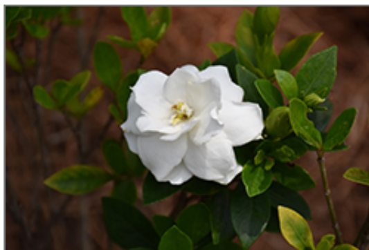
Swan Queen Gardenia flowers

There are many factors that will affect the ultimate height, spread and overall performance of a plant when grown indoors; among them, the size of the pot it's growing in, the amount of light it receives, watering frequency, the pruning regimen and repotting schedule. Use the information described here as a guideline only; individual performance can and will vary. Please contact the store to speak with one of our experts if you are interested in further details concerning recommendations on pot size, watering, pruning, repotting, etc.