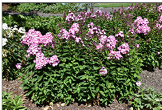
Volcano Pink with White Eye Garden Phlox in bloom