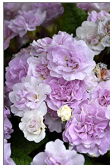
BELARINA PINK ICE Primrose flowers

BELARINA PINK ICE Primrose is recommended for the following landscape applications;