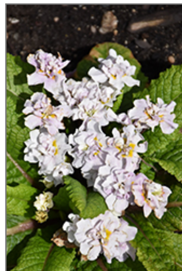
BELARINA PINK ICE Primrose flowers