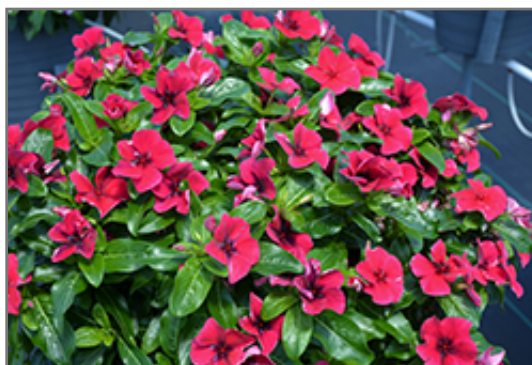
Tattoo Black Cherry Vinca in bloom