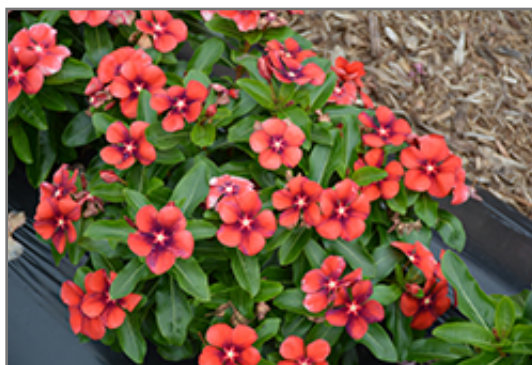
Tattoo Tangerine Vinca in bloom