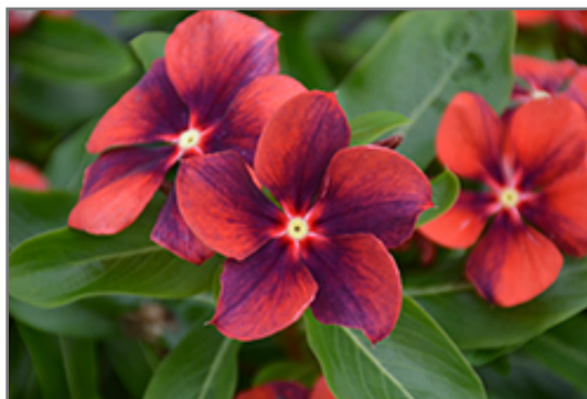
Tattoo Tangerine Vinca flowers

This plant will require occasional maintenance and upkeep, and should not require much pruning, except when necessary, such as to remove dieback. It is a good choice for attracting butterflies to your yard, but is not particularly attractive to deer who tend to leave it alone in favor of tastier treats. It has no significant negative characteristics.